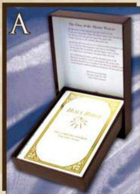
Available in any quantity. Custom imprinting only on quantities of 6 or more.