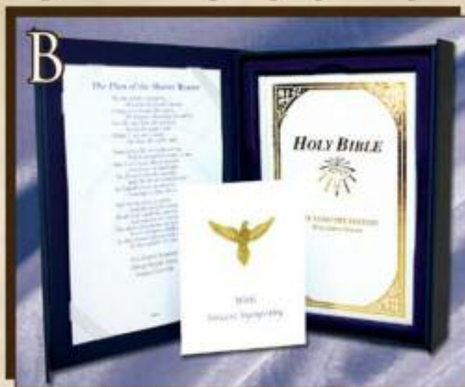
Available only for custom imprinting and in quantities of 6 or more.

A Memorial Bible in Stratford Presentation Case—Quality grain-finish; step in lid for attractive presentation; handsome gold-embossing.